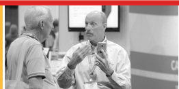
EXHIBIT SPACE CANCELLATION DEADLINE